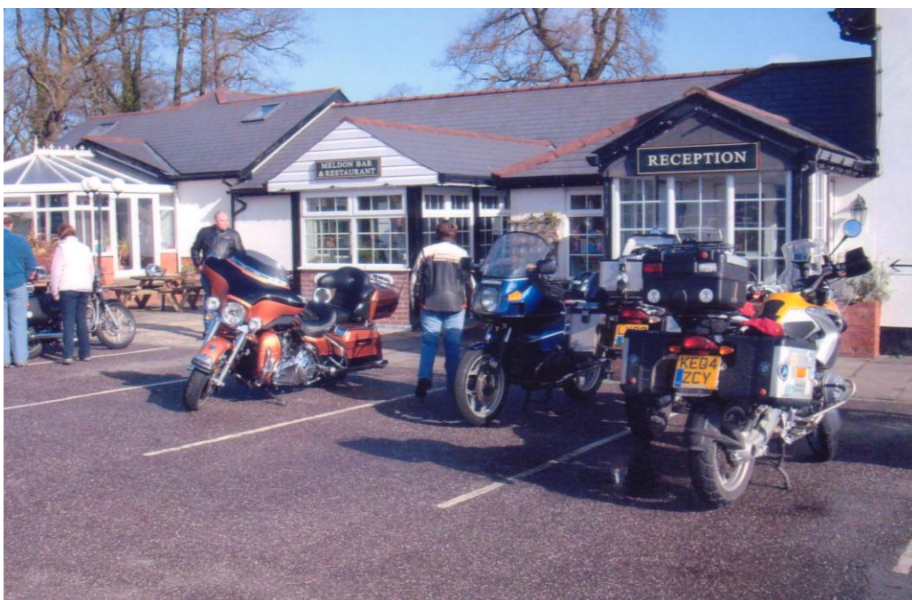
Preparing for the ride-out – some of the motorcycles assembled outside Betty Cottles Inn Okehampton.

weekend before, a map to show you how to find the Hostel. Tel No: 01873 855959